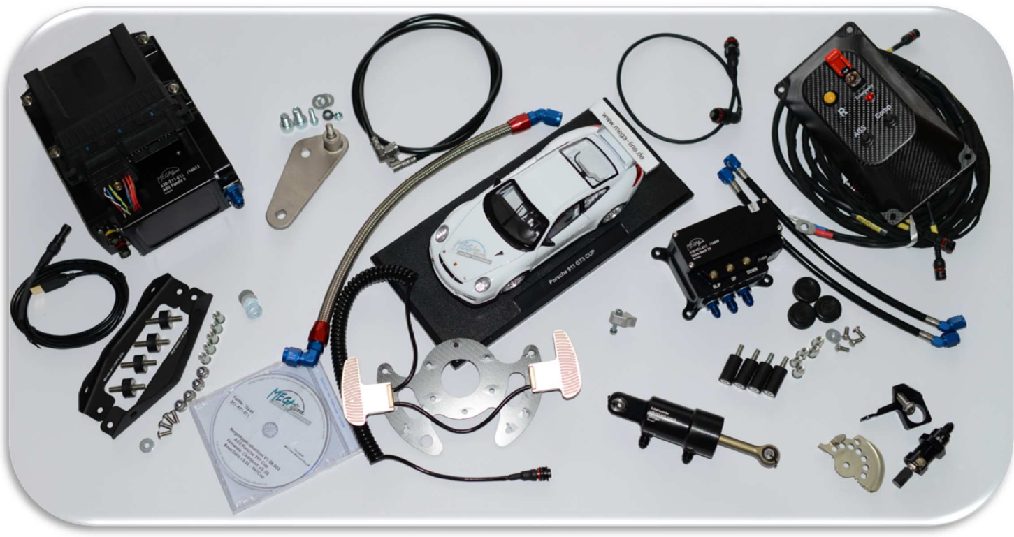
MEGA-Line Paddle Shift kit "Porsche 997 GT3 Cup Generation 2 (built from 2010)"